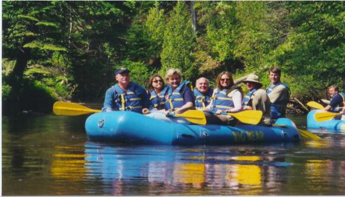
Governor Jennifer Granholm paddling with us as part of her "Hidden Treasures" Tour.

We reserve the right to cancel or reschedule any river trip to an alternate section of the river or to a different river if conditions warrant. Group rates are subject to change and are not available with any other offers or discounts.