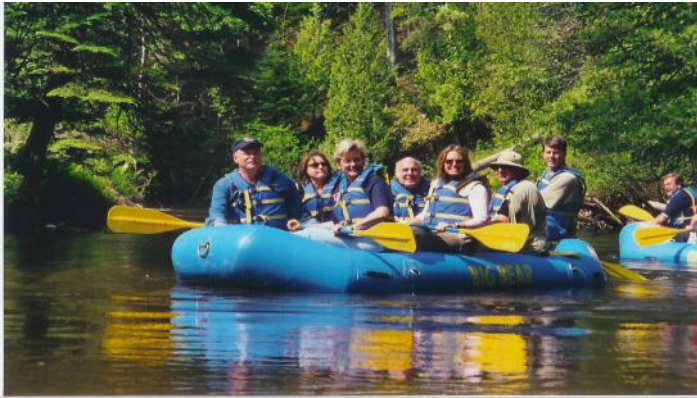
Governor Jennifer Granholm paddling with us as part of her "Hidden Treasures" Tour.

We reserve the right to cancel or reschedule any river trip to an alternate section of the river or to a different river if conditions warrant. Group rates are subject to change and are not available with any other offers or discounts.